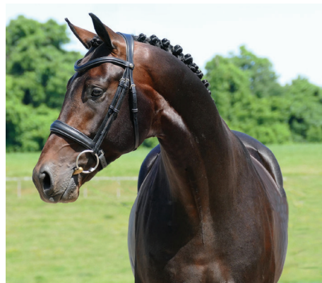
Hilltop Farm's Hanoverian Louisville HT is by Lord Leatherdale and out of Unicum.