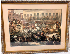
Framed Lithograph, Barnum's Museum