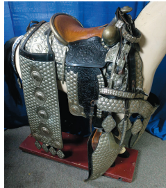
One of several Parade Saddles