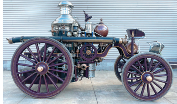
Restored American LaFrance Horse Drawn Steam Pumper, The LaFrance Fire Engine Co., Elmira NY, No. 399