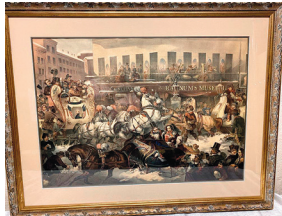
Framed Lithograph, Barnum's Museum