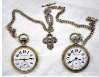
Pair of Brewster & Co. of Broome St. NY Pocket Carriage Watches