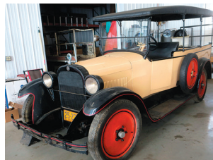
1926 Dodge Brothers Truck, Body by HH Babcock Co., Watertown, NY