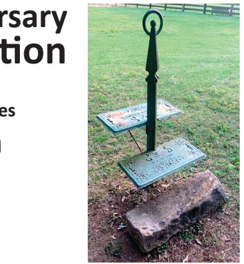
Cast Iron Stable Mounting Block