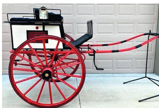
Restored Going to Cover Cart