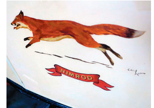
NIMROD doors - Original artwork done by Cecil Aldin, British artist & illustrator, best known for his paintings & sketches of animals, sports & rural life. April 28, 1870 – January 6, 1935, London, England.