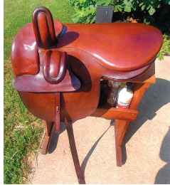
One of several quality Side Saddles