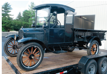
1921 Model T Market/Huskster Truck