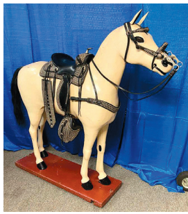
Harness Makers Display Pony, Pony - Height to top of ears 62", to withers 45", nose to tail 60" (Pony & Saddle sold separately). Vintage Pony Saddle with 11" seat (Pony & Saddle sold separately)