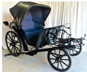
Restored Pony George IV