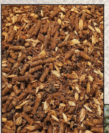
Textured Version: 13% NSC

These products compare very favorably to national brands.